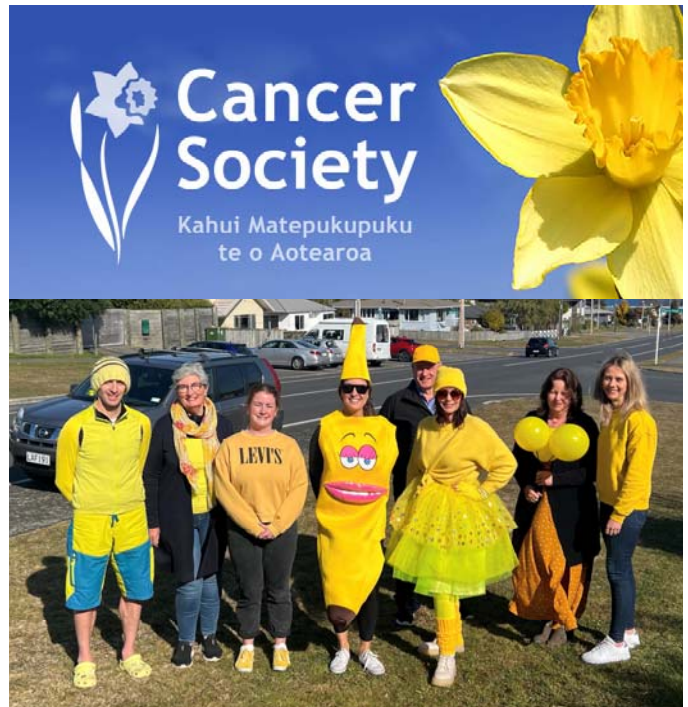
Blackburne Group proudly supporting the Cancer Society on Daffodil Day, August 2023